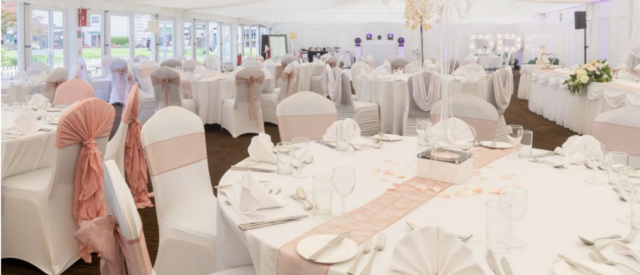
Table Centres from £19.50 per table